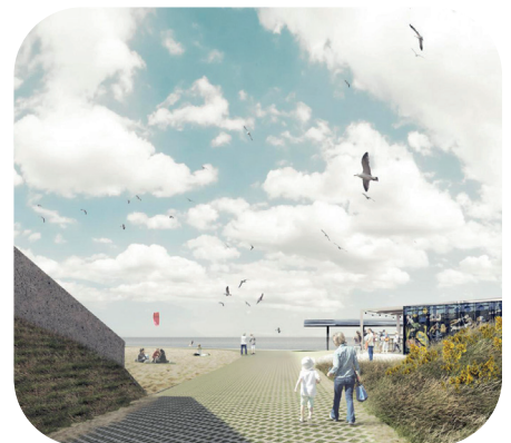
Examples of the #BrilliantBarrow Town Deal projects