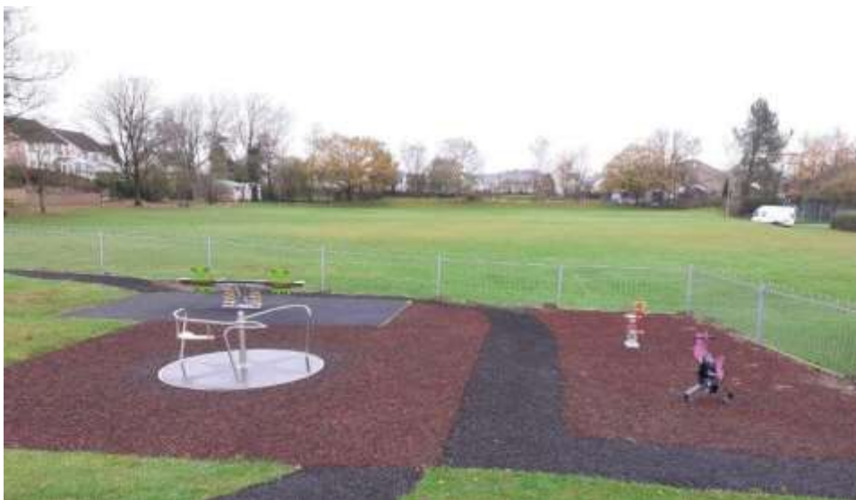
Figure 2: Improved play area, Endmoor

2.2.5 Monies from S106 obligations relating to the Sainsbury's development on Shap Road, Kendal have contributed towards improvements at the entrance to and along Stramongate. This scheme is currently in progress utilising remaining S106 monies available and other sources of funding.