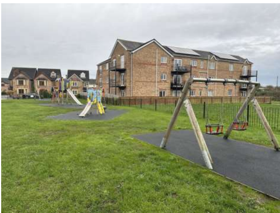
Figure 4: Children's Play Area at Sherborne Avenue, Barrow