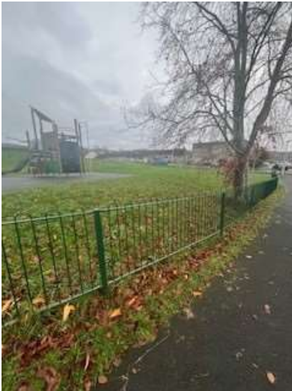
Figure 1: New fence around Hayclose Road play area, Kendal