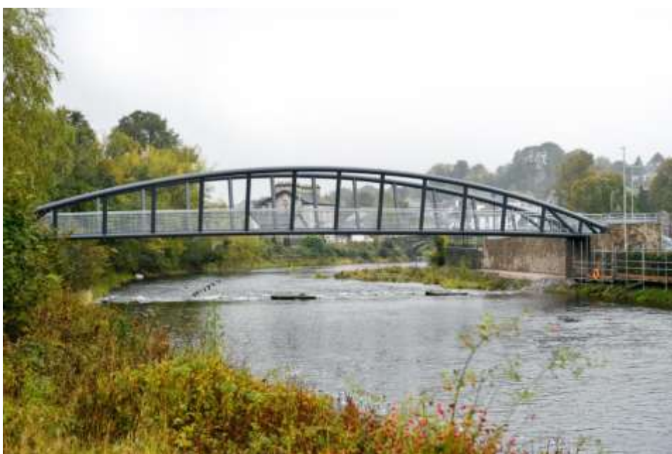
Figure 3: Gooseholme Bridge, Kendal

2.3.19 Significant elements of strategic infrastructure essential for the delivery of planned growth in the South Lakeland Local Plan were funded and delivered from a variety of other sources in earlier years. Examples include: